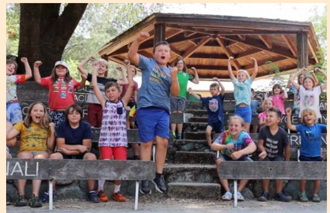
Amphitheater Still Working 2022