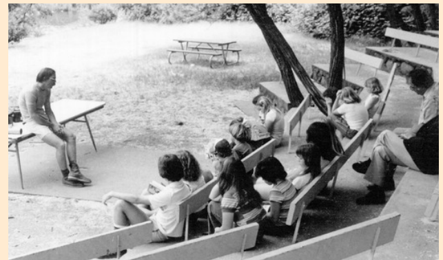
Amphitheater Steadily Working c. 1978

As the heart of the campus, the amphitheater is the premier outdoor teaching space for students. Day-long field trips and summer day camps have again commenced at WES and rehabilitation of the beloved, but crumbling space is a must. Please consider a gift now to help us reach the finish line!