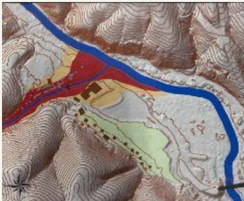
Geologic Hazard Map

Shasta County Office of Education (SCOE) and the National Park Service (NPS) are committed to re-opening of Whiskeytown Environmental School. Progress to date includes the completion of a geological safety study by NPS due to potential safety hazards. Fundraising efforts by the Redding Host Lions has paid for draft plans of the site rebuild in order to create a shared vision.