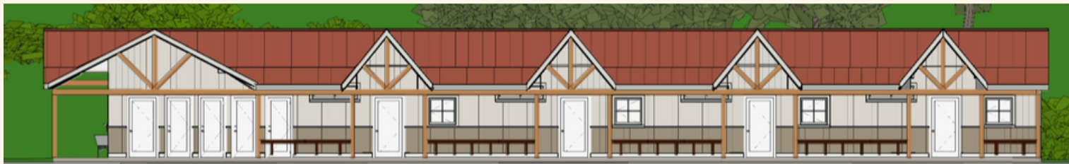
Proposed student housing