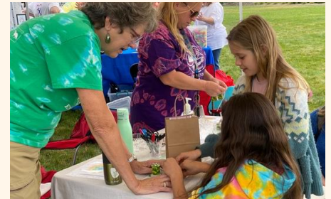
Bee Nest Building

WES Community hosted a booth at the Annual Redding Health Expo on Saturday, June 4th. This Dignity Health sponsored event offered an in-person experience for the public to meet organizations in the Northstate that represent a focus on fitness, health, nutrition, and medicine.