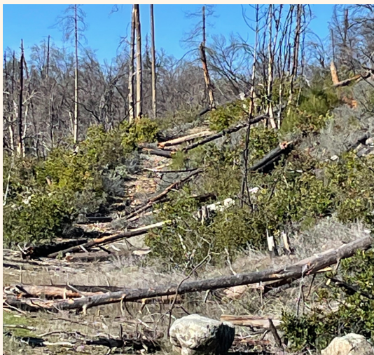
Burnt trees across the trail

WES Community is happy to announce the award of a trail rehabilitation grant for trails around the school! Students have been on campus for day programs since Fall 2021 and the surrounding trails are impassable, resulting in all programs being campus-centered.