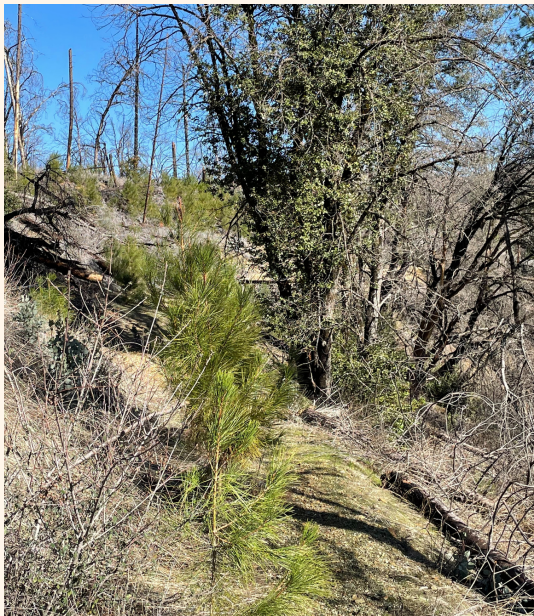
Tree regrowth in the middle of the trail