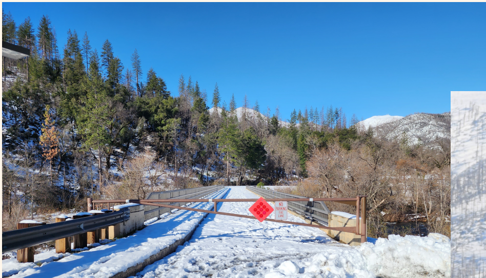
Entrance to WES with Shasta Bally in the distance