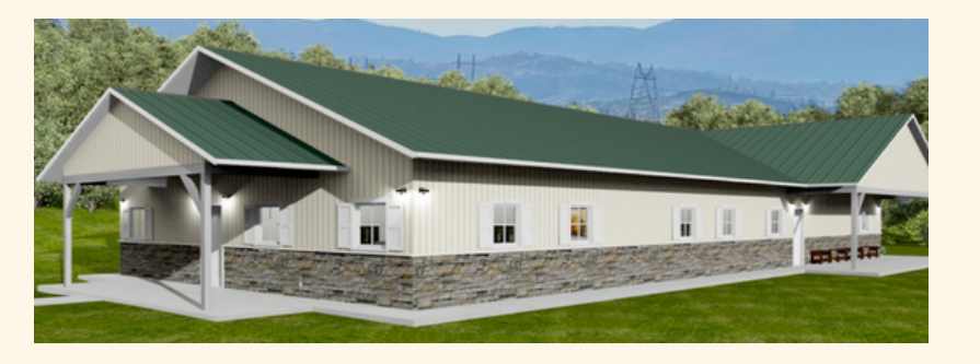
Proposed Administration-Safety Building