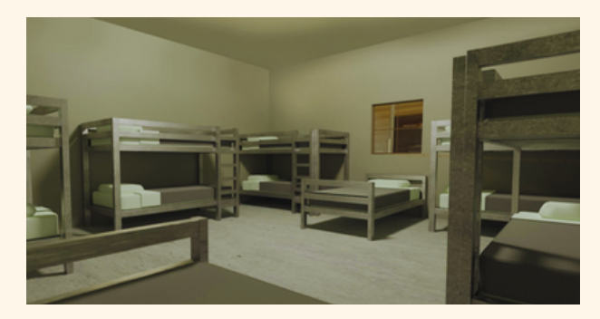
Interior Four-Plex Cabins