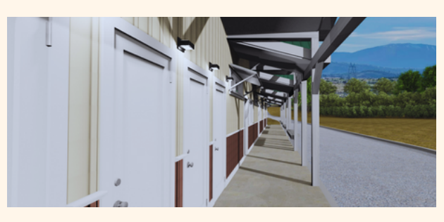
Exterior Corridor Four-Plex Cabins