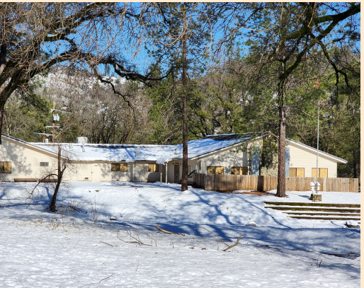
Jim Dowling Photo